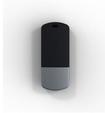
Figure 2. The Airlink fitting accessory

The benefits of the ReSound Unite wireless technology include a robust connection, easy to use accessories and discreet connectivity with the fitting software and accessories. These benefits are made possible through the ReSound Range™ hearing aid chip and use of 2.4GHz wireless technology. As the only hearing instrument manufacturer to incorporate this type of wireless technology in our products, we are able to transmit the signal over longer distances, up to 7 meters. Use of this technology limits interference from other devices and allows for a smaller antenna. Finally, there is no need for a bulky device to connect the hearing aids to the fitting software. All that is required to connect the devices to the fitting software is a fitting accessory, called the AirLink, which is inserted into a USB port of the computer (Figure 2). This technology, though new to hearing aids, has been proven in the gaming industry and in the use of wireless keyboards. The benefits that translate to the hearing aid user include improved clarity of wirelessly-transmitted sound, reliable wireless connections, smaller devices and elimination of echo and lip sync issues when watching television or listening to other audio sources.