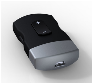
Figure 4. The ReSound Unite Phone Clip

information will result. The Unite TV Streamer's speed of 18ms ensures no echo or lip sync issues will disrupt or distort the viewing experience for the user. Since the Unite TV Streamer plugs directly into the television or other audio source such as a DVD player or stereo receiver, there is no need to wear anything around the neck or on the person. Hearing aid users can walk freely around the room up to 7 meters from the television and enjoy amplified sound directly through the hearing aids. They can participate in conversations as well as listening to the TV, all just by wearing their ReSound Alera hearing instruments.