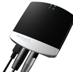
Figure 3. The ReSound Unite TV Streamer

The ReSound Unite is a package of wireless accessories with one goal in mind: to connect the hearing aid user to the technology around them. Audio can be directly streamed from the television, computer or stereo to the hearing aids via the Unite TV Streamer. The Unite Phone Clip attaches to the mobile phone. The remote control allows users to access the technology they choose in a simple manner, while monitoring the status of their hearing instruments.