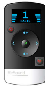
Figure 5. The ReSound Unite Remote Control

The Unite Phone Clip (Figure 4) is a small device that links the mobile phone to the hearing aids through Bluetooth technology. Introduced in 1994, Bluetooth technology involves low-noise radio transmission that is digitally controlled. 3,4 Operating around the 2.45 GHz radio frequency, it is usually used to connect digital devices in relatively close proximity 5,6 , and has become the standard for wireless mobile phone headsets. Around the size of a matchbook or brooch, the Unite phone clip can be affixed to the clothing or worn in a pocket, eliminating the need for a bulky accessory to wear close to the head. Alternately, it can be clipped to the sunshade in the car for hands-free mobile phone use. Users can enjoy clear speech on the phone through wireless connectivity to the hearing instruments.