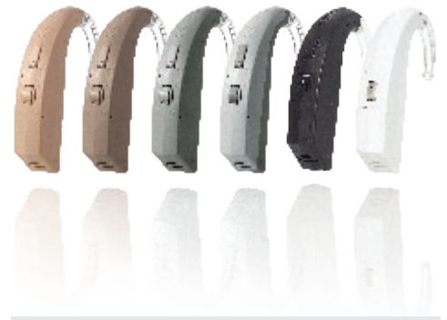
Sonic Endura Power BTE

Fact: Directionality has been shown to provide the same benefit to patients regardless of their amount of hearing loss 2 . Modern directional systems can fully equalize a directional response, making the system loud enough for severe-to-profound listeners without the increased noise floor interfering.